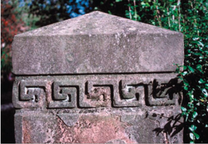
Building Stones of the West End