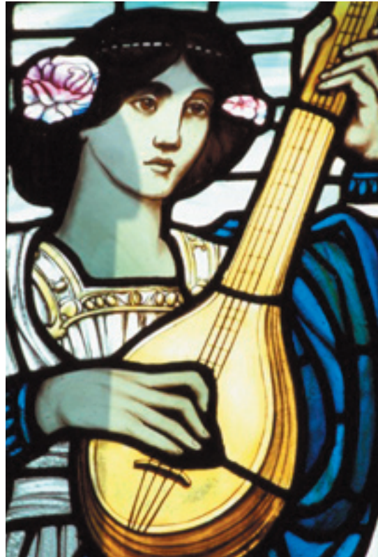
Domestic Decorative Glass